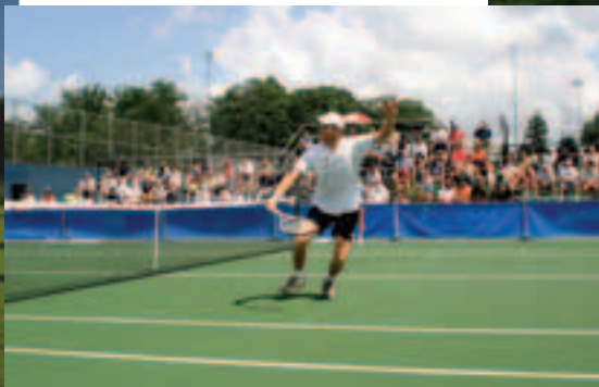
Tennis Tournament at Recreation Park