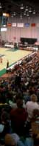
Broome County Veterans Memorial Arena