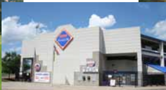
Exterior of NYSEG Stadium