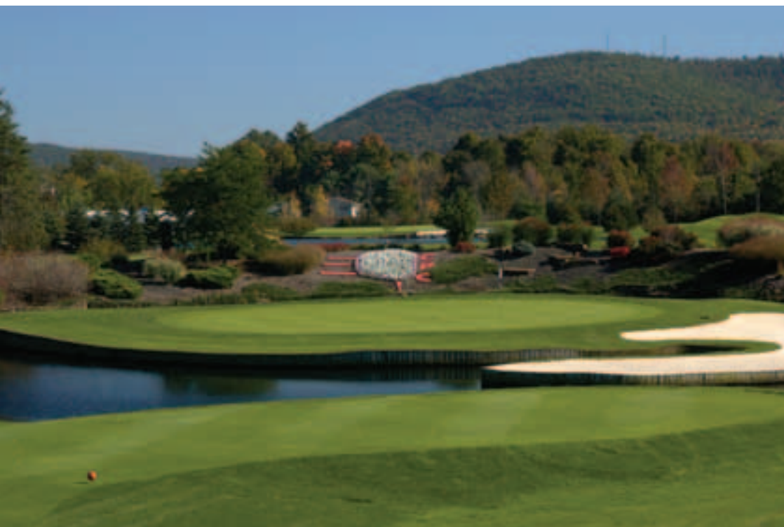
Conklins Players Club

"Binghamton's connection to major highways make it easily accessible for our sports participants from Massachusetts, Connecticut, New York City, and South Carolina. The Broome County Veterans Memorial Arena has so many beautiful features that make it truly unique and the CVB was wonderful in helping us make a choice between the area's wide variety of great lodging and dining options."