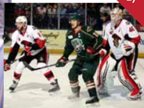
Binghamton Senators 2011 Calder Cup Champions