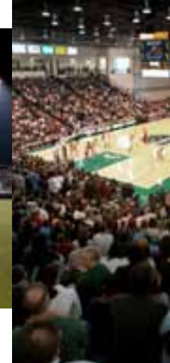
Bearcat Events Center