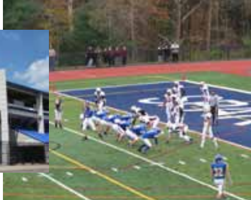
Maine-Endwell School Football Field