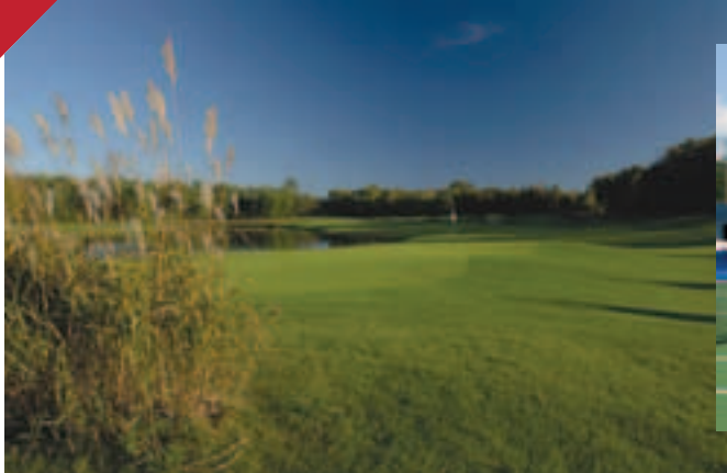
Links at Hiawatha Landing