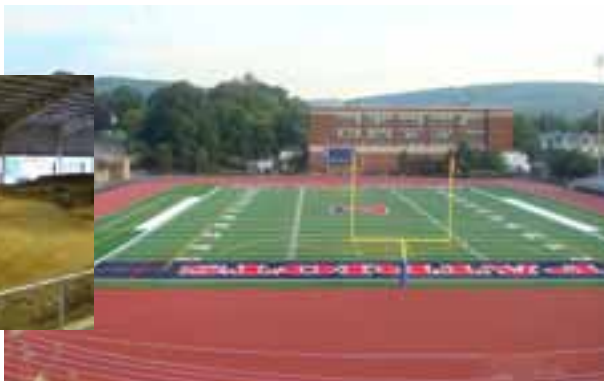
Binghamton Alumni Stadium