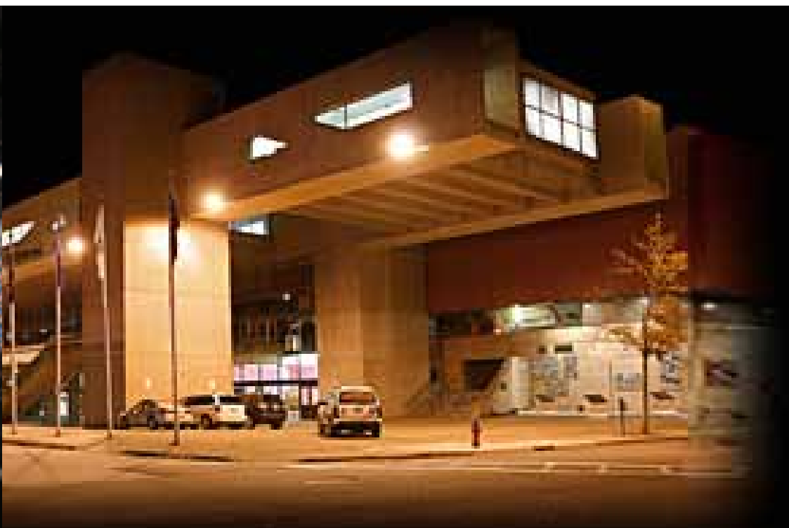
Broome County Veterans Memorial Arena

"Broome County STOP-DWI is proud to promote the Chris Thater Memorial and STOP-DWI Holiday Classic events in our community. These nationally recognized events not only promote a STOP-DWI message, but help to showcase our community and make Greater Binghamton a destination point."