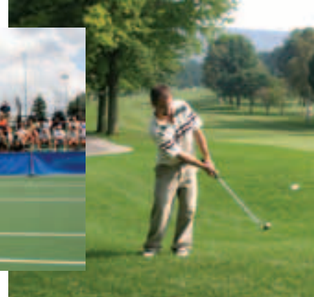
Award-winning Golf Course

1850 Vestal Parkway West Vestal, NY 13850 Tel: (607) 748-7888 Contact: Joe Underwood Email: info@chucksters-vestal.com Website: www.chucksters.com Facility Use: Miniature Golf