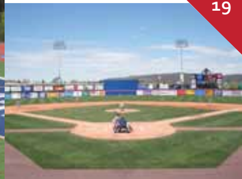
Interior of NYSEG Stadium

Facility Use: Baseball, Dance, Field Hockey, Football, Golf, Gymnastics, Lacrosse, Multi-youth Fields, Soccer, Softball, Volleyball, Wrestling – complex has both indoor and outdoor facilities