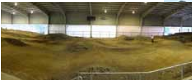
Grippen Park BMX