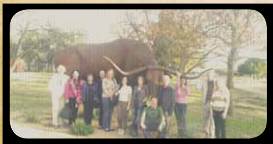
Photo Op: Take a family photo with Rusty, mascot at the Museum of the Southwest.

Lunch at Palio’s Pizza Cafe then consider renting giant frisbees and sliding down the sandhills at Monahans Sandhills State Park . Or go snorkeling with the fish at Balmorhea State Park .