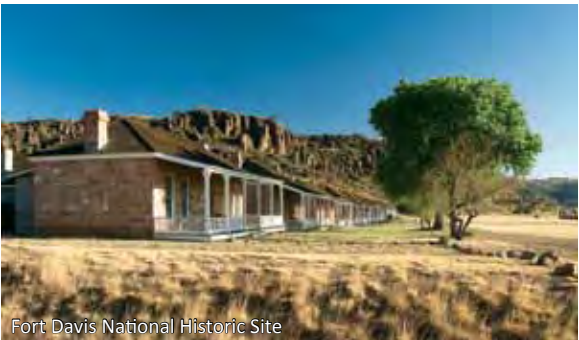
Fort Davis National Historic Site

Established in 1854, Fort Davis was a key defense post of western Texas. Today, Fort Davis is one of the best remaining examples of a frontier military post. During the summer season, park rangers and volunteers dressed in period clothing present living history programs in some of the furnished buildings. Approximately 170 miles south of Midland.