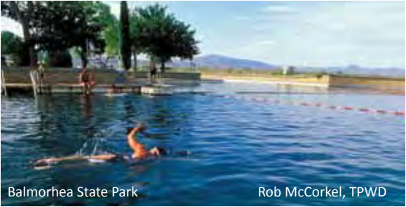
Balmorhea State Park