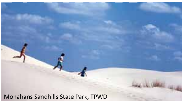
Monahans Sandhills State Park, TPWD

Nearly 4,000 acres of wind-sculpted sand dunes, some up to 70 feet high. Approximately 50 miles west of Midland.