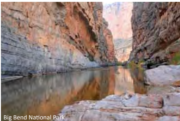
Big Bend National Park

Enjoy an artesian spring pool fed by San Solomon Springs. The pool stays a constant 72 to 76 degrees and has a variety of aquatic life in its clear waters. This park has plenty of opportunities for camping, swimming, scuba and skin diving. Approximately 150 miles southwest of Midland.